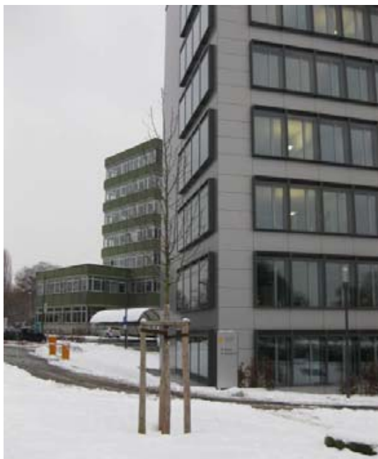
Vergleich Verwaltungsbäude Altbau (links) zu Neubau (rechts) (523, 2009)