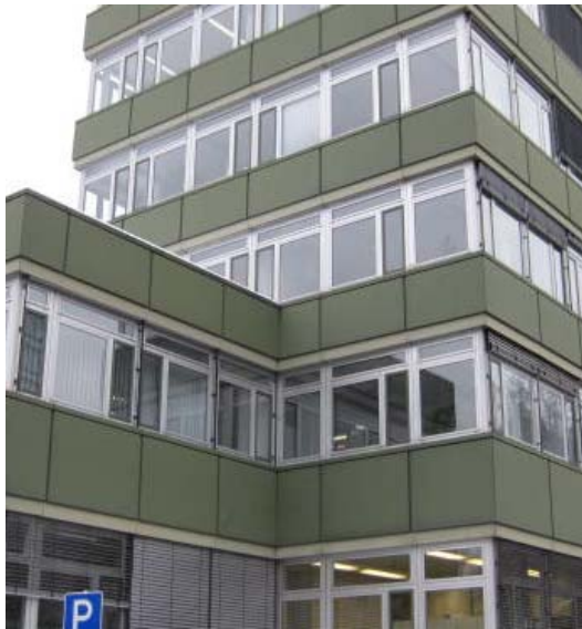
Verwaltungsbäude Altbau Nord (523, 2009)